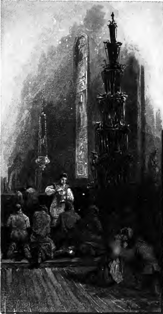
THE COLLECTION OF CRUTCHES.

or spruce beer, huge slices of brown bread and butter, berries, gingerbread, boiled corn on the cob, and other Canadian luxuries, on the sills of the windows, or on rough deal tables at the doors. Inside you see long rows of solemn white cups and saucers, and piles of plates. In one little auberge there is a queer